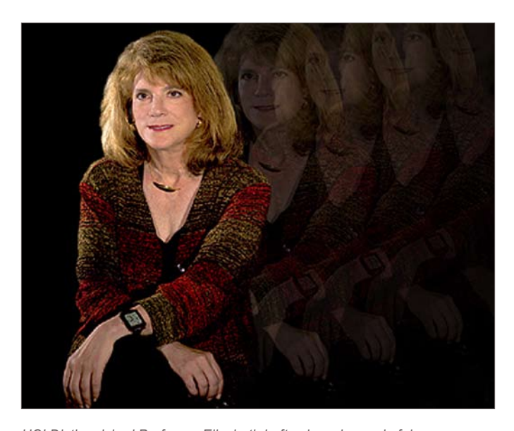
UCI Distinguished Professor Elizabeth Loftus is a pioneer in false memory research, and has proven that memory is highly susceptible to distortion and suggestion.

The faculty, many of whom are nationally recognized, have expertise in a wide range of specific social science topics, for example, the mathematical modeling of perception and cognitive processes; the economic analysis of transportation; the examination of the impact of society's political system on its economy; the study of