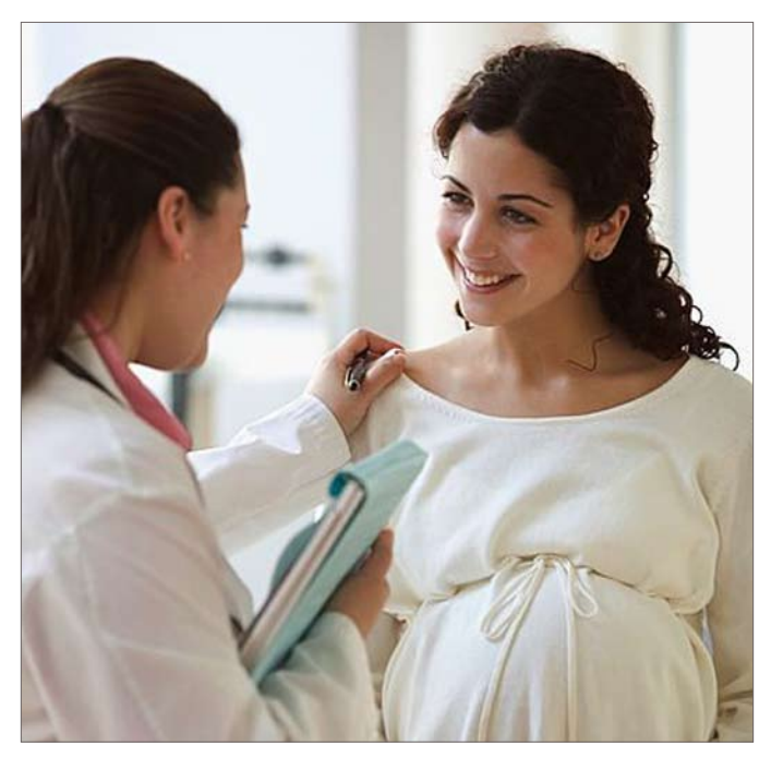
The PRIME-LC program within the School of Medicine provides specialized training for future physicians strongly committed to careers in public service, improving health care delivery, research, and policy in underserved Latino communities.