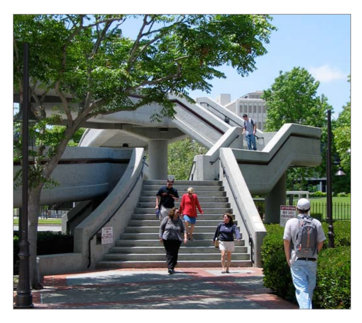
The Raymond L. Watson pedestrian bridge connects UCI to restaurants, shops, and offices in the University Center retail complex.

areas are designed to serve building clusters rather than individual structures.