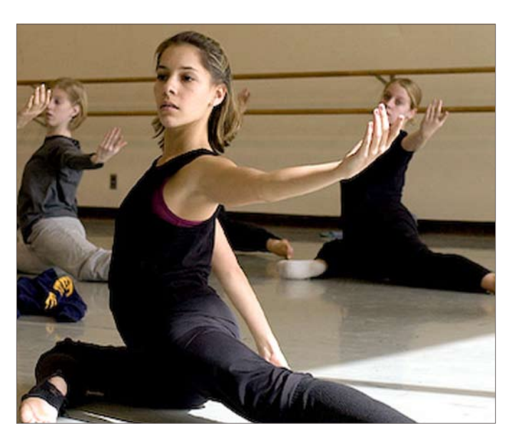
The UCI Department of Dance has achieved world-wide recognition for its programs of graduate study and undergraduate study, centering on performance, artistic research, scholarship, and pedagogy.

Arts students regularly participate in choirs, instrumental ensembles, drama and dance productions, and art exhibitions. Qualified students from other