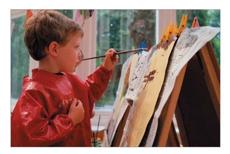
Designed as a professional development institute for primary teachers, the UCI Department of Education's ArtsCore project strengthens shared literacy instruction by developing arts experiences from the disciplines of dance, drama, music, and visual arts.

Faculty associated with the Department of Education include researchers and scholars of national and international reputation. Many faculty have taught or served as administrators in public schools, and all are committed to the continual improvement of education through conducting research and developing more