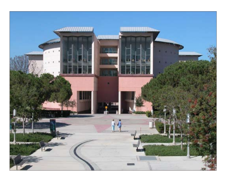
UCI's Science Library is one of the largest consolidated science, technology, and medical libraries in the nation.

as well as a growing array of manuscripts, visual materials, and microforms, all in both electronic and print formats. In addition, the UCI Libraries maintain ties to all UC libraries and other lending sources.