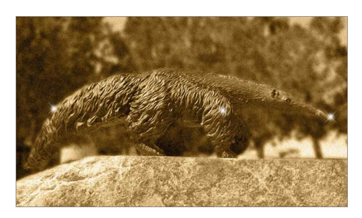
UCI students selected the anteater as the school's mascot in November 1965. This 430-pound bronze statue in the plaza area of the Bren Events Center was a gift from the Class of 1987.