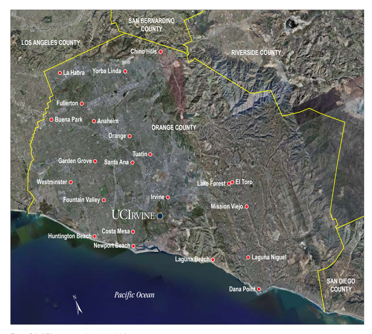
Figure 2-1. UCI campus and regional vicinity.

beach communities to the south. The San Joaquin Hills Transportation Corridor (a toll road extension of SR-73) provides access to the campus from areas in southern Orange County.