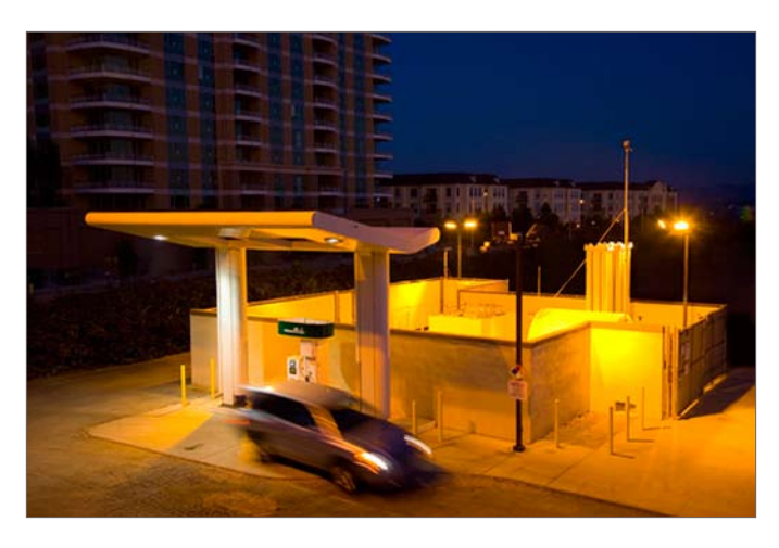
On February 27, 2007, UCI celebrated the grand opening of its automobile hydrogen fueling station—the first of its kind in Orange County. When used to deliver energy, hydrogen produces zero or very low emissions. The emissions from a hydrogen fuel cell-powered vehicle contain only water vapor.

Throughout its history, UCI has endeavored to implement programs and techniques that create environmentally sensitive buildings and systems. UCI has been a leader in incorporating design features, technological adaptations, and planning principles into campus projects to conserve resources and minimize