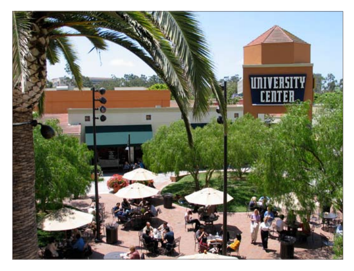
The University Center retail complex adjacent to the UCI campus is a popular destination for students and campus employees.

UCI can experience ground fogs, particularly in the winter months. Although heavy, these are usually nocturnal and dissipate by mid-morning.