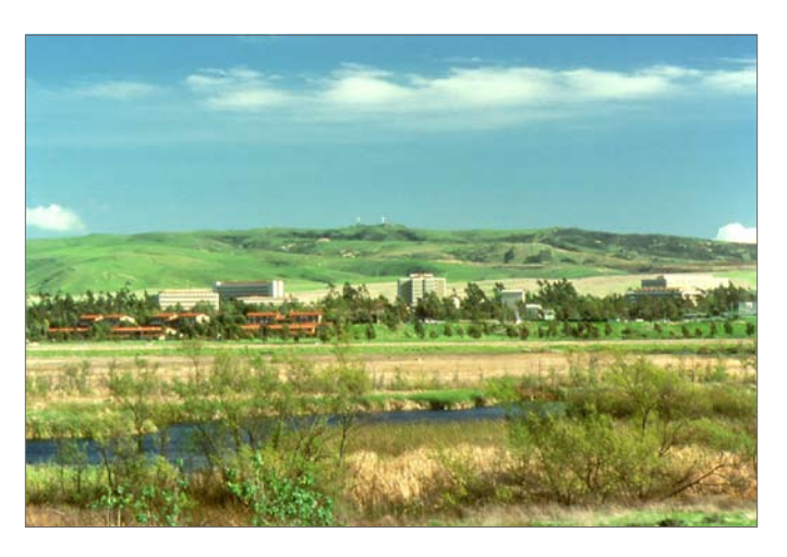
The San Joaquin Freshwater Marsh Reserve represents one of the last remnants of freshwater wetlands that once covered much of Orange County's flood plain. Located in an ancient river-cut channel at the head of Newport Bay, the reserve supports a variety of wetland habitats, including freshwater marshlands, shallow ponds, and channels confined by earthen dikes. Dry upland habitats with a remnant coastal sage scrub community rise on the margins of the reserve.

Ecologically sensitive areas are generally located in the outer campus, including UCI's Ecological Reserve which contains the majority of coastal sage scrub habitat remaining on the campus. In 1996, UCI enlisted the Ecological Reserve and additional campus lands