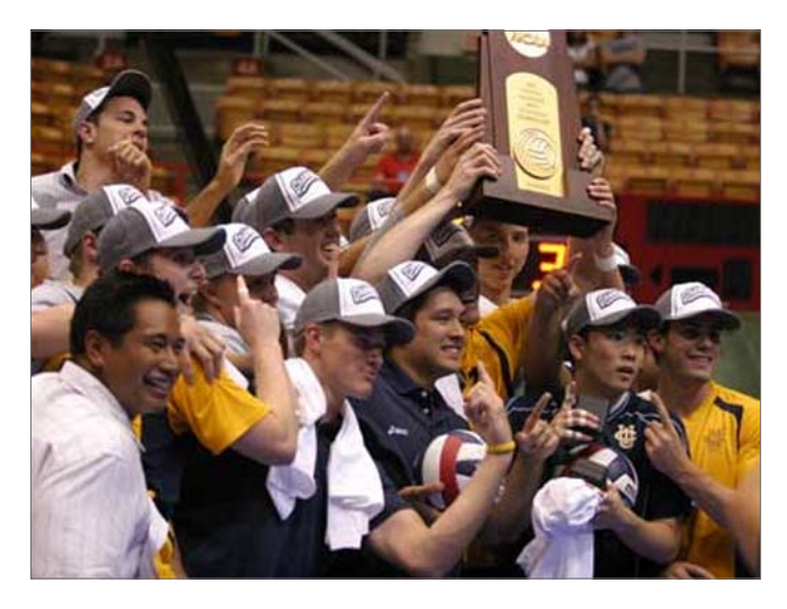
The men's volleyball team won the NCAA championship on May 5, 2007. It was UCI's first national championship since the men's water polo team took the crown in 1989.

performance, sportsmanship, diversity, and gender equity. Intercollegiate Athletics also supports the University of California's mission of public service and serves to generate a unifying spirit among students, faculty, staff, and alumni that transcends communities, cultures, and generations. The Bren Events Center seats 5,000 for intercollegiate basketball, volleyball, and othere events. The Crawford Hall complex, in addition to housing the athletic administration offices, also includes sports medicine, strength and conditioning, and studentathlete academic support services. Crawford Court gymnasium has 760 seats for volleyball. Outdoor facilities include Anteater Stadium, a 2,500-seat facility for soccer and track; the 500-seat Anteater Tennis Stadium; Anteater Ballpark, home to the baseball program; and a five-acre multipurpose field complex. UCI's Anteater Aquatic Complex houses the intercollegiate water polo, swimming, and diving teams. This 64-meter aquatics facility is designed with a movable bulkhead to accommodate multiple activities simultaneously.