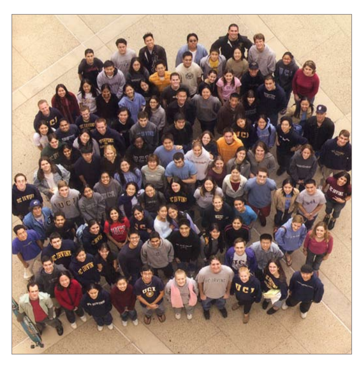
UCI makes available to its students the education, skills, and credentials that provide the basis for lifelong personal and professional growth.

Student enrollment at UCI is discussed in this LRDP in terms of student headcount enrollment, or