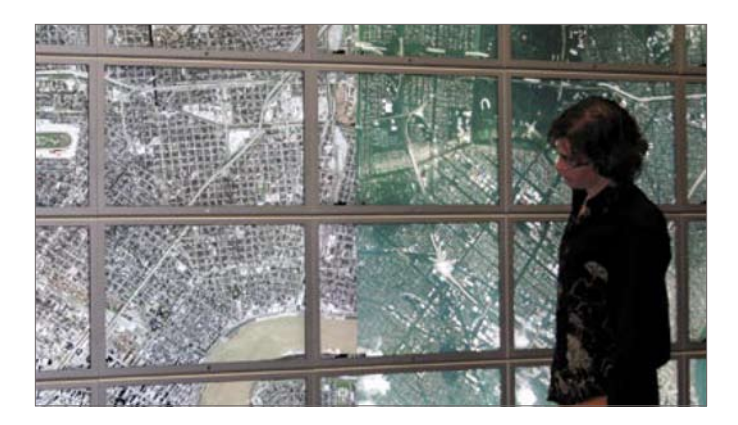
Researchers at the California Institute for Telecommunications and Information Technology developed the HIPerWall (Highly Interactive Parallelized Display Wall), the world's highest-resolution gridbased display for visualizing and manipulating massive data sets. Measuring over 200 square feet, the 50-panel wall brings to life terabyte-sized data sets, including biomedical images, climate datasets, and geological data.